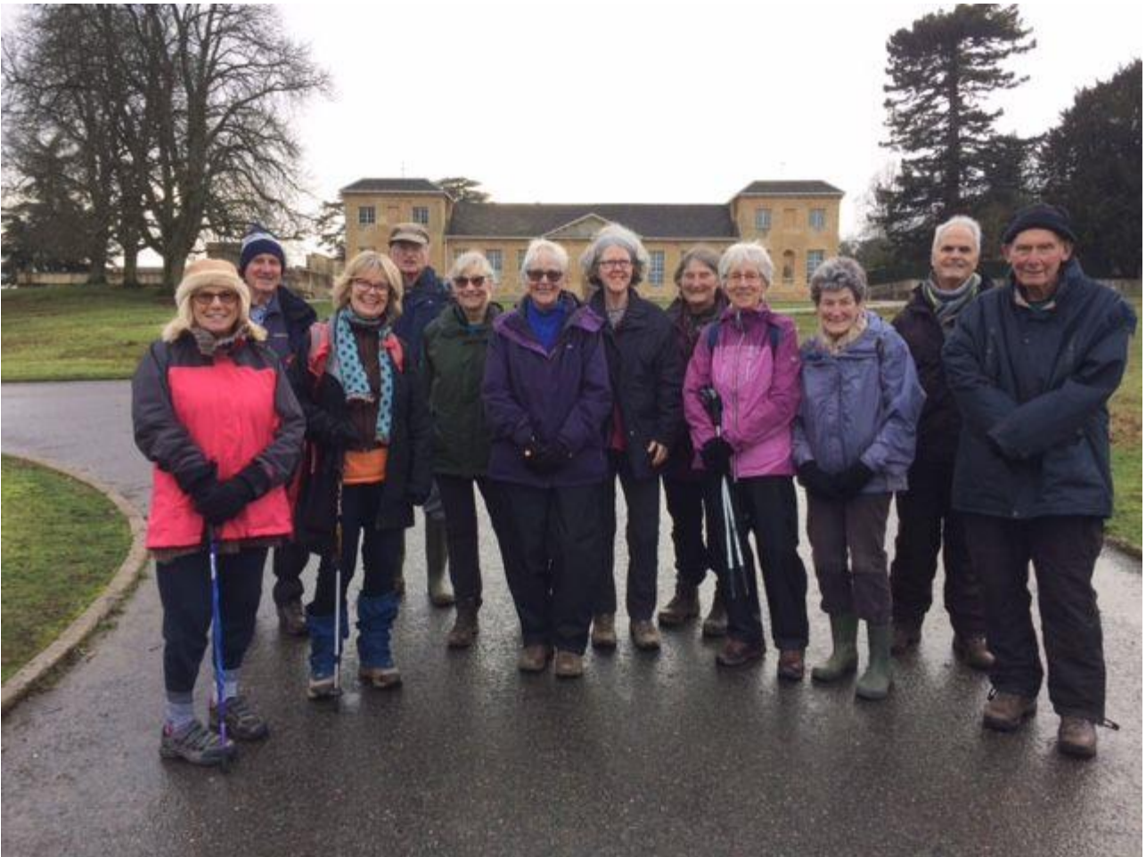
New Year's Day 2022 at Cornbury Park